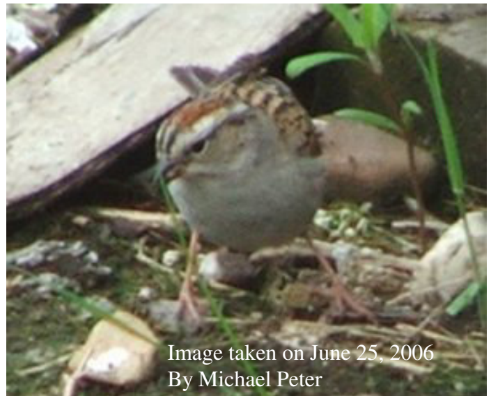
Image taken on June 25, 2006