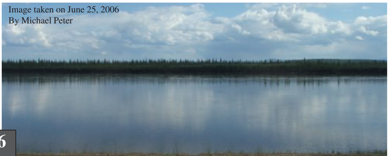
Image taken on June 25, 2006